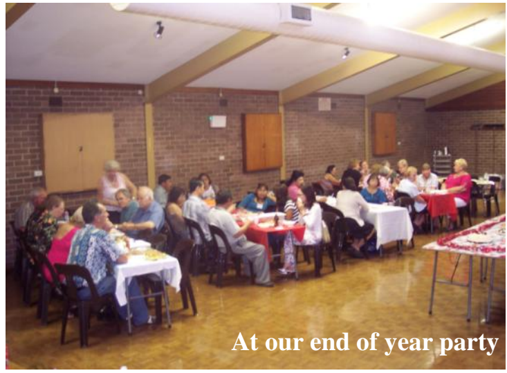
At our end of year party