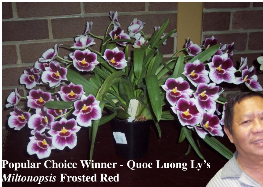
Popular Choice Winner - Quoc Luong Ly's Miltonopsis Frosted Red