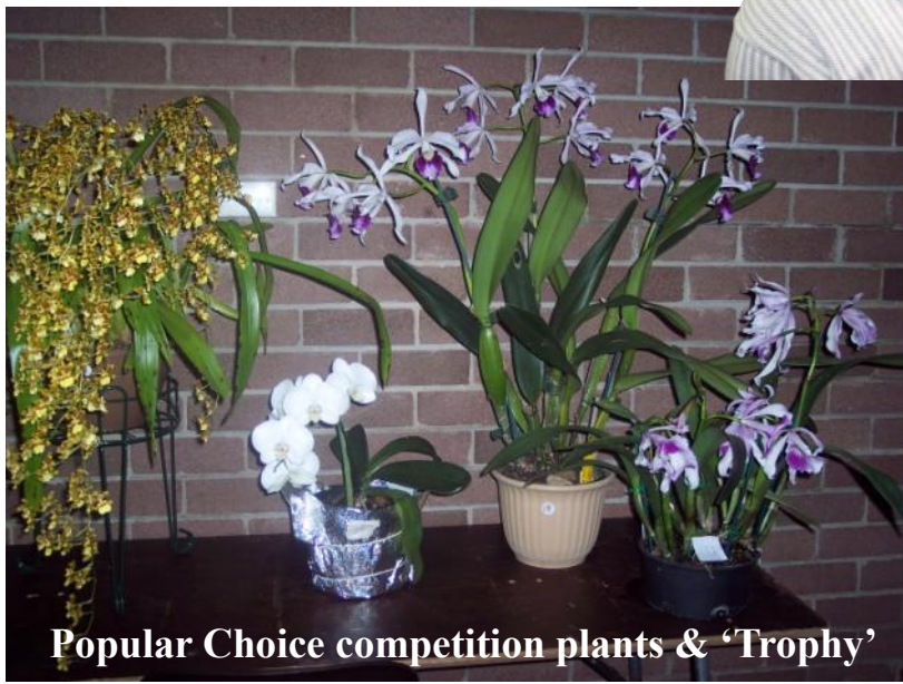
Popular Choice competition plants & 'Trophy'