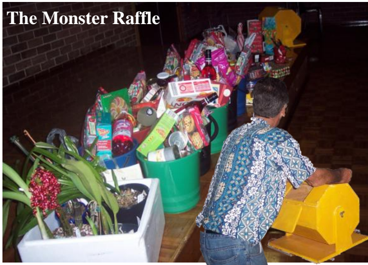
The Monster Raffle