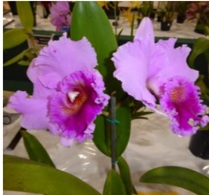
Kim Mung's Blc. Sylvia Fry 'Dundas' x Blc. Tribute 'Independence Day'