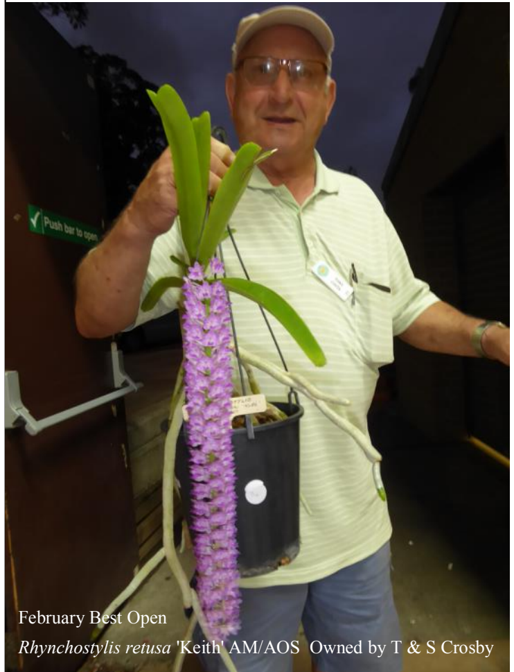
February Best Open